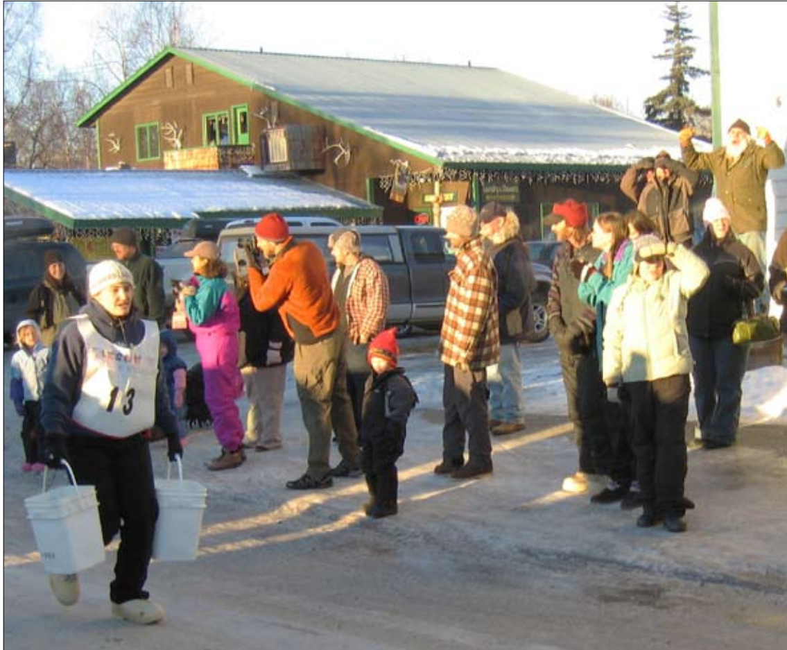
Rushing a pail full of water to the finish line isn't easy while negotiating slippery ice in bunny boots.