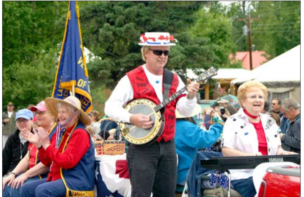
Bathtub Gin is Talkeetna’s own ragtime band. There’s music, food and games for the kids. Go to www.talkeetnahistoricalmuseum.org for updated schedules.