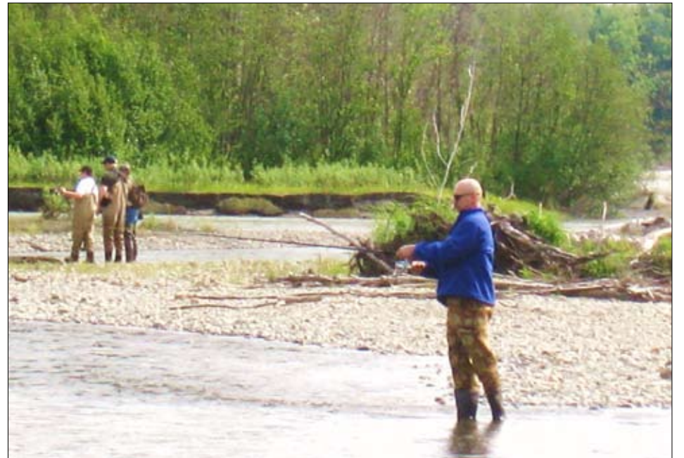
Montana Creek is a popular fishing venue along the Parks Highway system.

Fishing is strong on the Russian River and in other Kenai-region fishing grounds, and Anchorage’s Ship Creek is also packed with anglers.